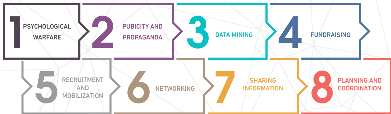
Figure 2: Types of Cyberterrorism Category 2 – Facilitated by the system

mation technology has been used: as a means to facilitate terrorism, including the hacking for intelligence; encrypted terrorist communications via the web; propaganda, i.e. bypassing journalistic editing and government censorship; psychological warfare, by generating anomalous pattern of traffic, giving a false impression that an operation may be imminent; fund-raising and recruitment; distant training, e.g. of attack technique and skills, training manual publication, weapon making manual (Figure 2).